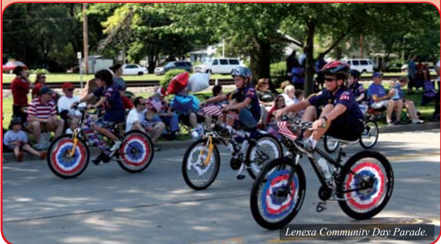
Lenexa Community Day Parade.