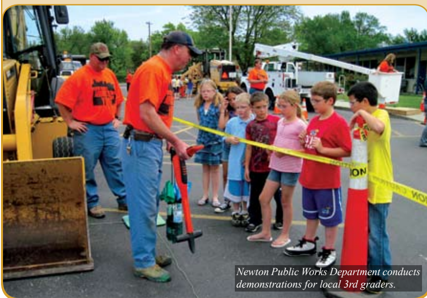
Newton Public Works Department conducts demonstrations for local 3rd graders.