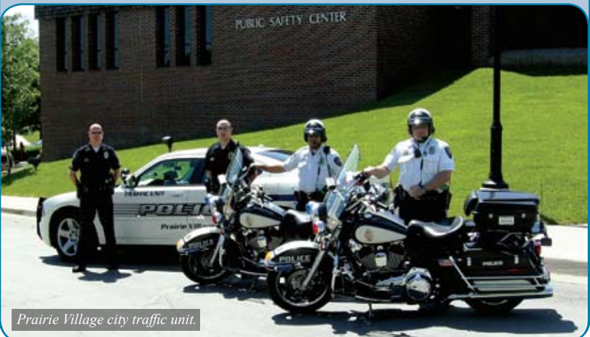
Prairie Village city traffic unit.